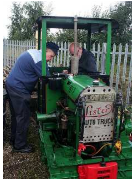
Driver experience on the heritage open day

With the nights starting to draw in the group is thinking about jobs to be done over the winter when we are not keeping warm over the stove in the Potting Shed.