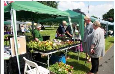
Nursery stall at Poppleton Sports Day in May

Last issue of The Potting Shed showed a blue tit on one of Nursery's bird boxes. Your editor didn't see whether the blue tits used the box, however in the last few weeks a pair of tree sparrows has raised a family in the same box.