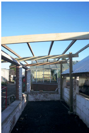
Uprights and crosspieces.

Our two winter jobs have been the building of a car port-type roof over greenhouse G7 and the refurbishment of a new truck. Due to a succession of fine-weather Thursdays, the latter has rather been neglected although some