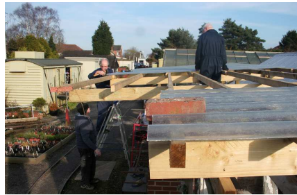
Attaching the roofing panels

work has been carried out. On the roofing job by Christmas the supports for the uprights and three uprights were in place, the remainder of the uprights and the crosspieces followed soon after, followed by the roofing. Most of the guttering is also complete.