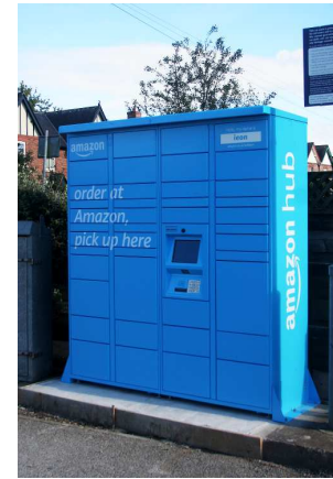
The Amazon Parcel Collection Box

Following representations to Northern, the Amazon Parcel Collection Box which was proposed for Platform 1, and which would have obscured the flower bed, will now be sited in the car park. Northern's prompt response to our request for this resiting is appreciated.