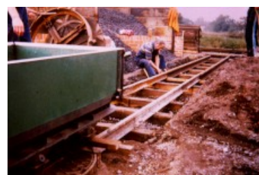
The first narrow gauge railway at Poppleton

You've probably heard of Rail 200, a year-long celebration to mark 200 years since the opening of the first public railway, the Stockton & Darlington. The Nursery is also celebrating an anniversary this year, the 40 th anniversary of the first laying of the narrow gauge railway. We are hoping to celebrate this later on in the year, so watch this space.