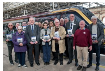
Launch of Northern Rail Heritage book

It available price £5 from Kents Bank Station Library, cheques for £8 (including post and packing) to Kents Bank Library, c/o Station House, Kentsford Road, Grange-over-Sands LA11 7BB.