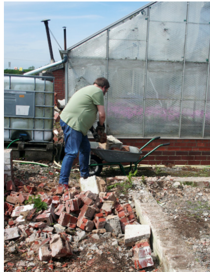
A Network Rail group member moving rubble from G8