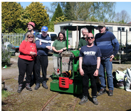
Open Country Group

There have been two successful group visits, one by Open Country and a second of the year by Network Rail. Even though the latter group only had two people much work was carried out including removing rubble from G8 thus clearing the area and wire brushing the 3-mile post.